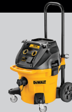
DWV012 10-GALLON DUST EXTRACTOR WITH AUTOMATIC FILTER CLEAN