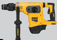
DCH481B 60V MAX* 1-9/16" SDS PLUS CORDLESS COMBINATION HAMMER DRILL (BARE)